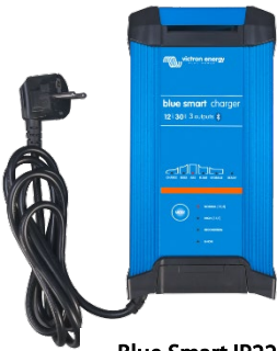
Blue Smart IP22 12/30 (3)